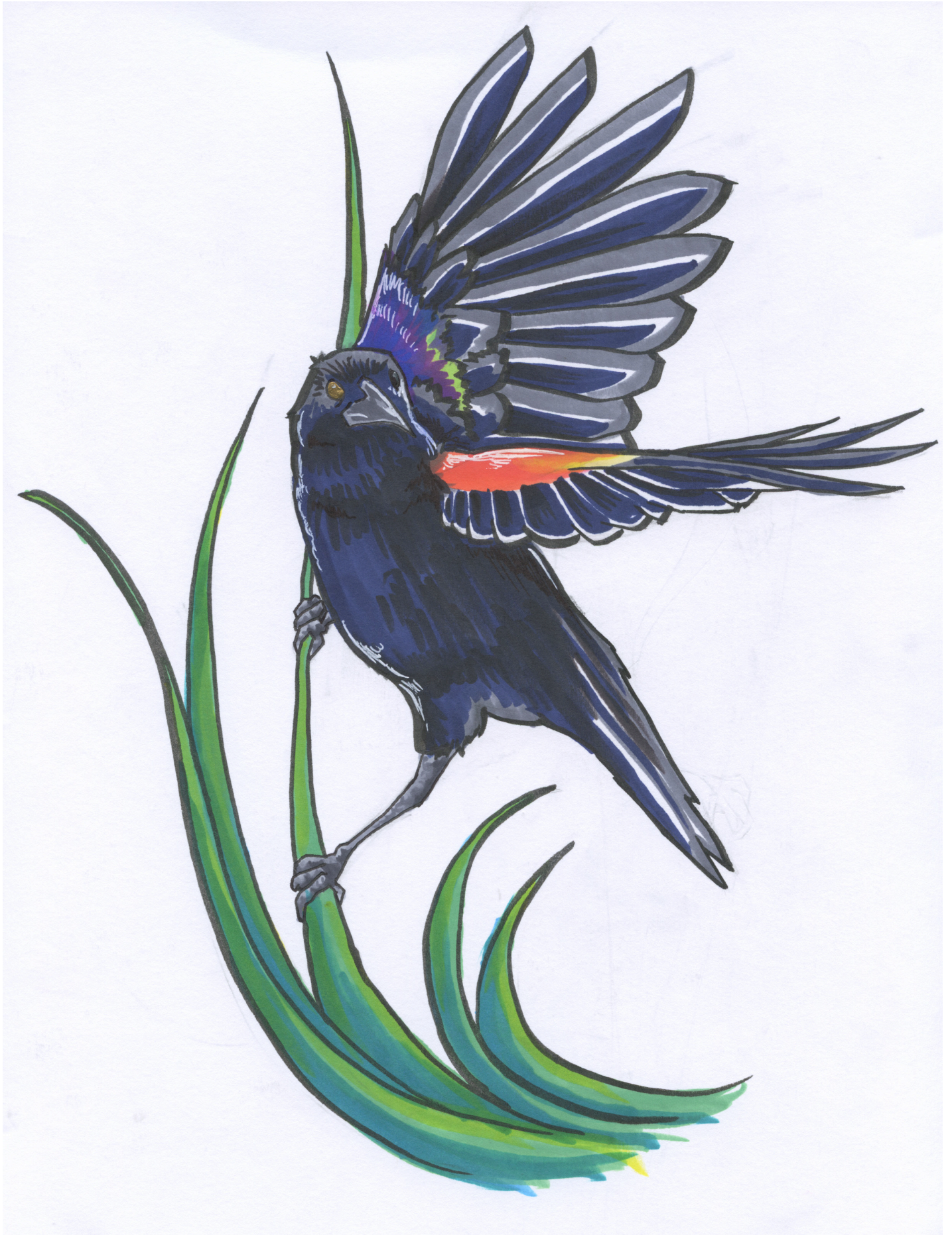
Illustration by Isabella Miller